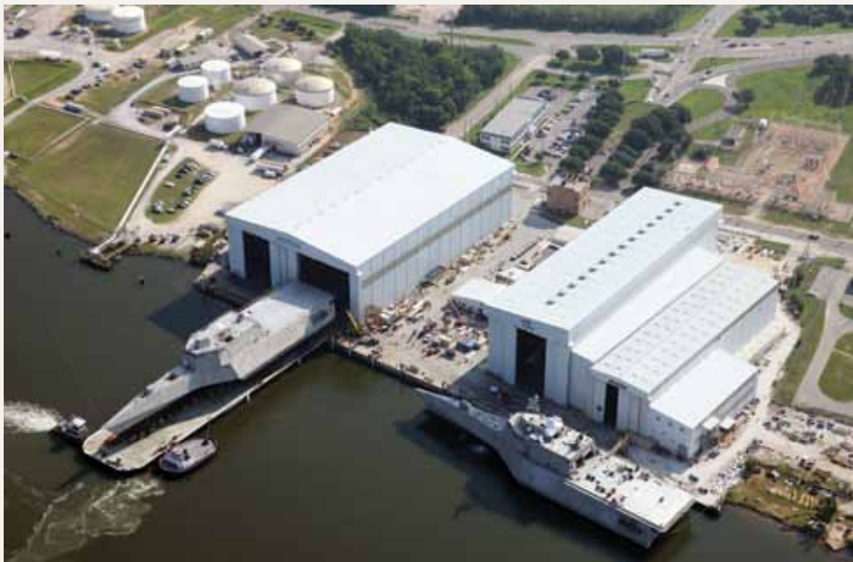
Australia-based Austal was named one of Alabama's most admired manufacturers. Pictured is the company's shipbuilding complex in Mobile, Ala.

(Fayette, Lamar, Marion counties); St. Clair Co.; Huntsville; Elmore Co.; Talladega Co.; Chambers Co.; Etowah Co.; Jefferson Co.; Walker Co.