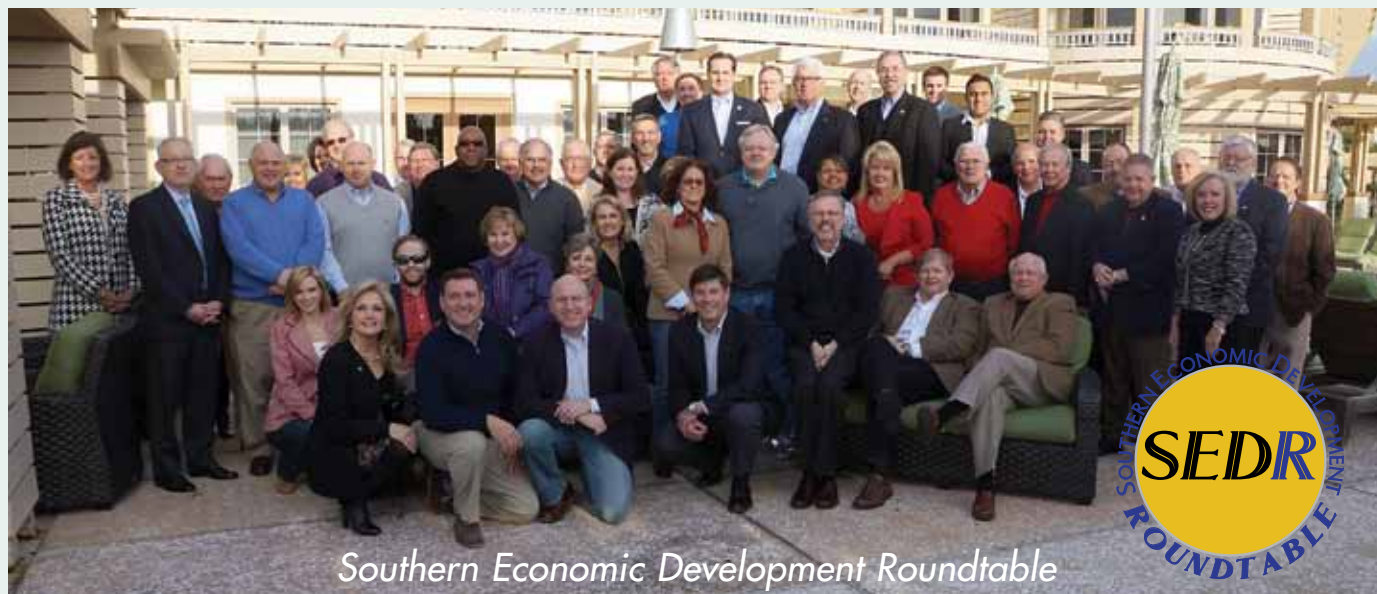
Southern Economic Development Roundtable

We polled the members of the Southern Economic Development Roundtable to come up with the best of 30 economic development categories in each Southern state. SEDR is an invitation-only group of economic developers, educators, economists, site consultants and CEOs who meet once a year in January at WaterColor in Santa Rosa Beach, Fla. The no-fee-to-attend, no-agenda meeting is an opportunity for 50 of the South's best economic development minds to discuss issues relative to economic development in the American South. A group photo of the 2015 SEDR class is published above.