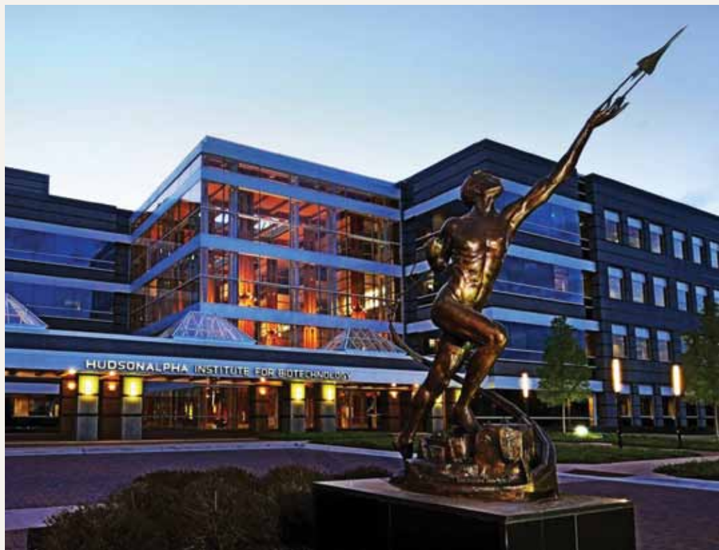
The HudsonAlpha Institute for Biotechnology in Huntsville, Ala., was voted one of Alabama's most important employers.